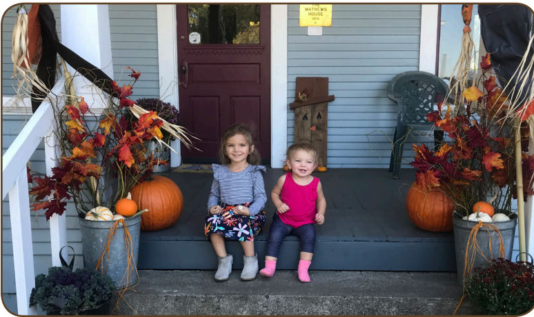
A few very small and very happy customers.