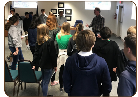
CCCS 8th graders held a Mock City Council at City Hall in October.