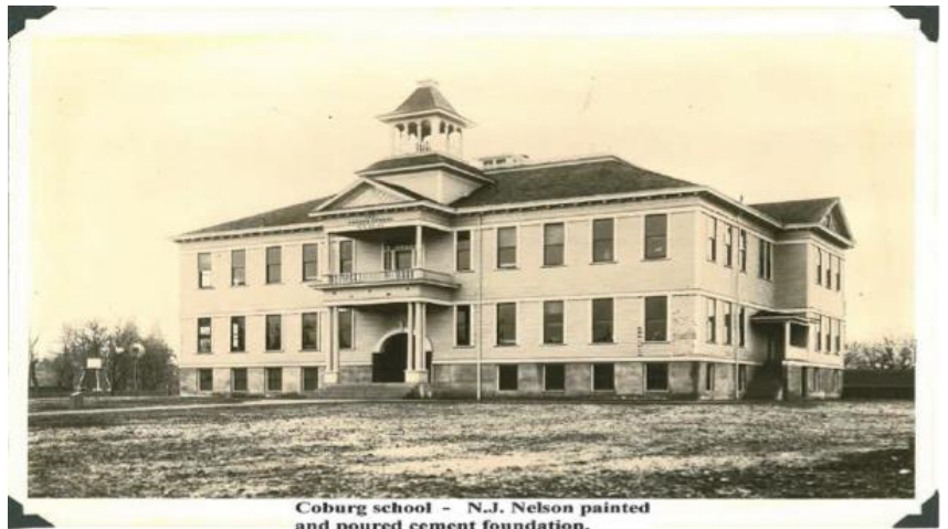
Coburg school - N.J. Nelson painted and poured cement foundation.

"At last we as citizens of (school) district No. 43, are permitted to look upon the completed last large stride of school improvement in our district—the $20,000, 10 room school house. The several rooms were occupied Monday by teachers and pupils, and they are nicely settled, with good light and plenty of room."