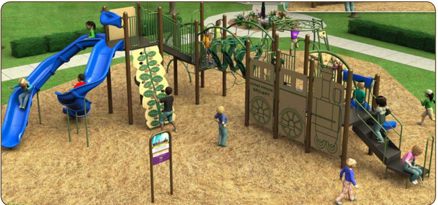
Play equipment conceptual drawing.

of the location of the park which was home to the Oregon Railway Limited. The park will feature an historic and educational sign, as well as panels on the structure which reflect the depot theme. In addition to the new structure, a new spin cup will replace the current damaged rocker, and the 0-3 year-old swing set will receive necessary repairs including new belt seats. The intention of the Parks Tree Committee and the City of Coburg is to have the park ready for play by Spring Break of 2016.